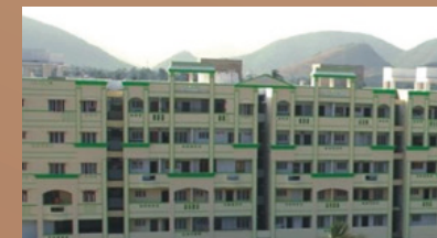
Anand Nagar Location : Madhurawada