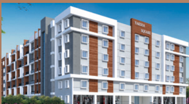
Yaksha Square Location : Boyapalem