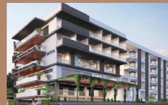
Adyssa Location : Bheemili