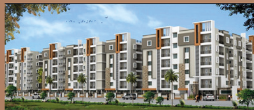
Anand Arcade Location : Madhurawada