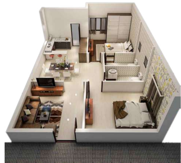
Flat 03 - 1100 SFT 2BHK - NF