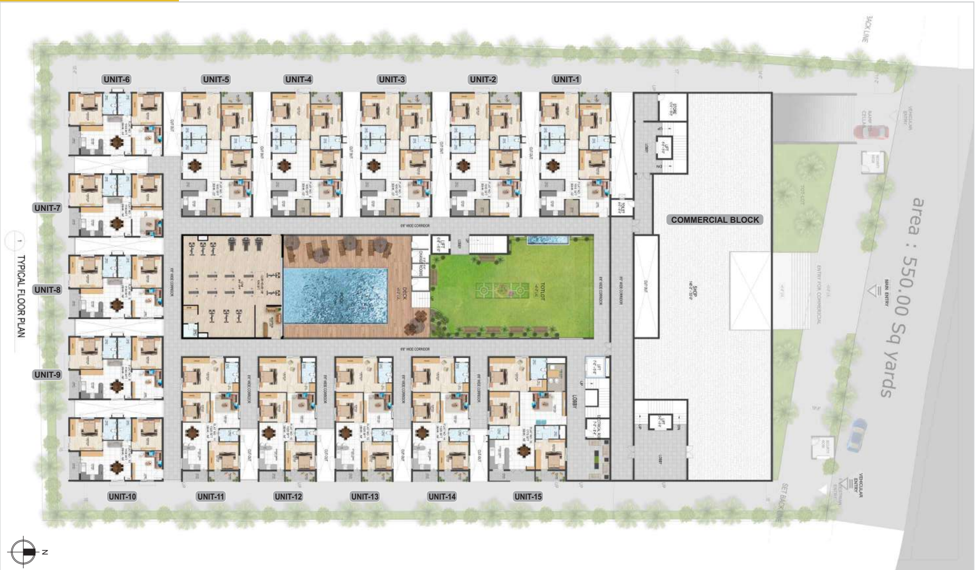
1 TYPICAL FLOOR PLAN