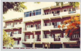
Bhavana Enclave - II Maharanipeta