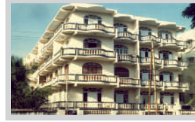
Abhilash Enclave - I Kirlampudi Layout