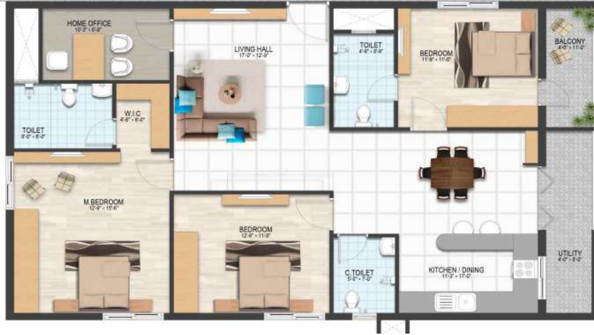
Flat 01 - 1775 SFT 3BHK - NF