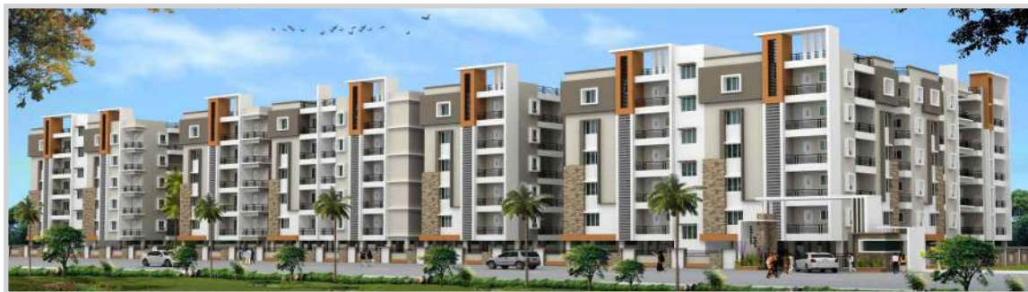
Anand Arcade (Gated Community) Madhurawada

FEW PREVIOUS VENTURES & (23 MORE PROJECTS)