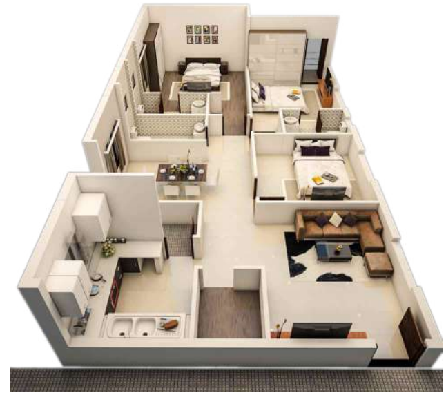
Flat 04 1610 SFT 3BHK - EF