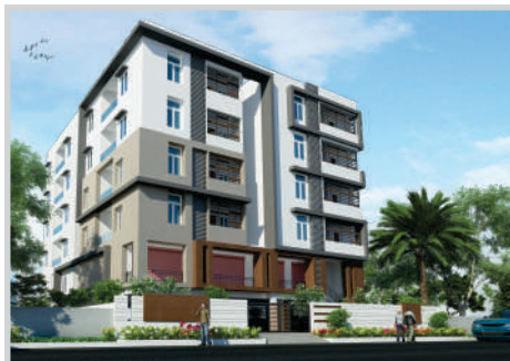
Yaksha Homes Boyapalem