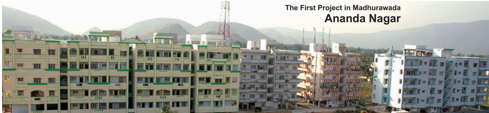
The First Project in Madhurawada Ananda Nagar