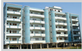
Keerthana Arcade Madhurawada