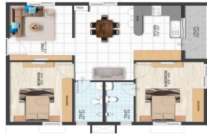
Flat 03 - 1100 SFT 2BHK - NF

Note : All the flat sizes (Sfts) mentioned are including common areas.