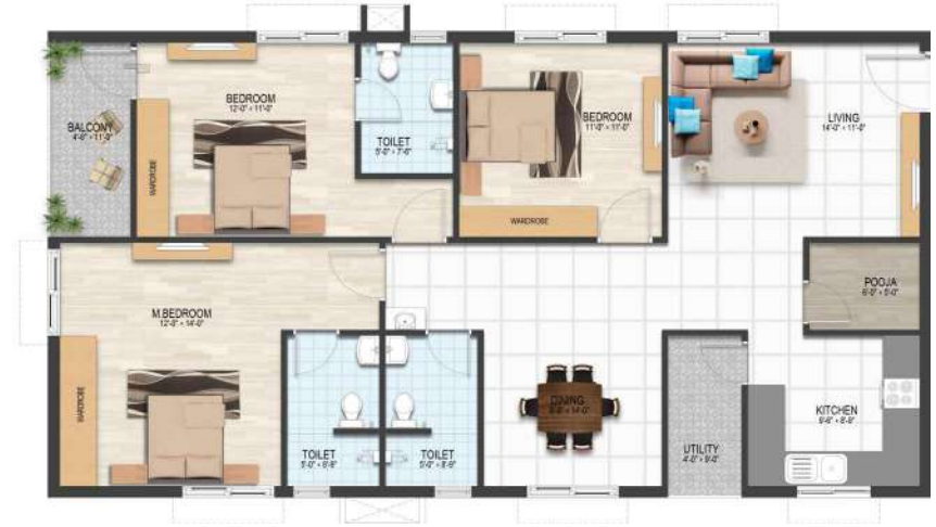
Flat 04 - 1610 SFT 3BHK - EF