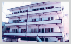
Ashwin Enclave - II Akkayyapalem