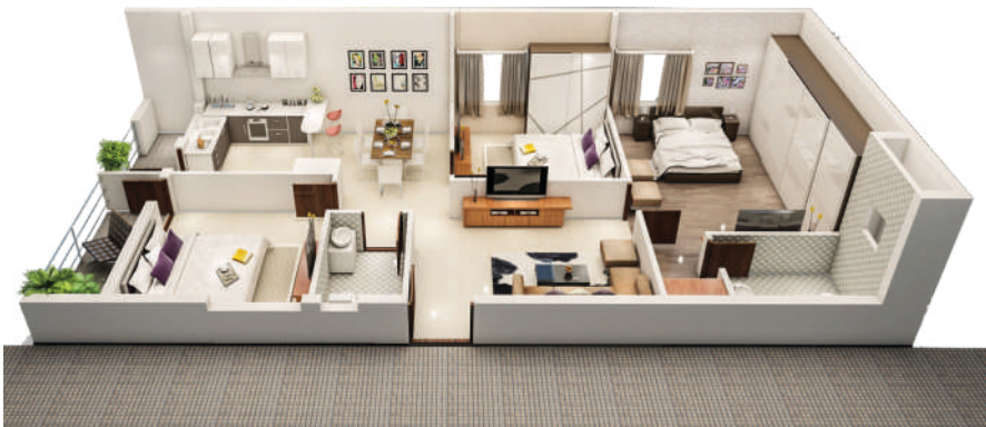
Flat 02 - 1320 SFT 3BHK - NF