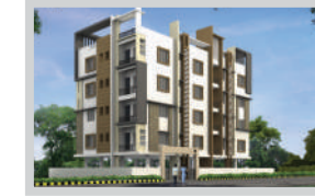
Radha Residency Madhurawada