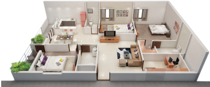
Flat 01 - 1775 SFT 3BHK - NF