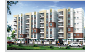
Ananda Prastha Madhurawada