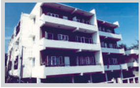
Ashwin Enclave - I Assamgardens