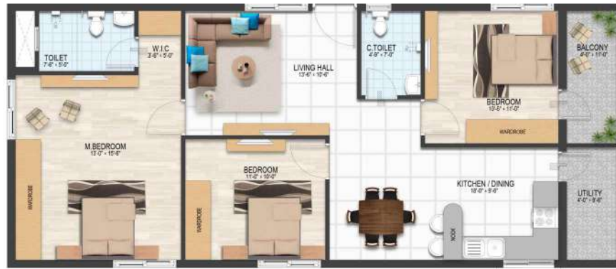
Flat 02 - 1320 SFT 3BHK - NF