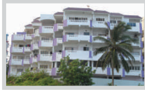
Keerthana Enclave - II Kirlampudi Layout