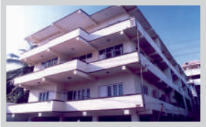
Abhilash Enclave - II CBM Compound